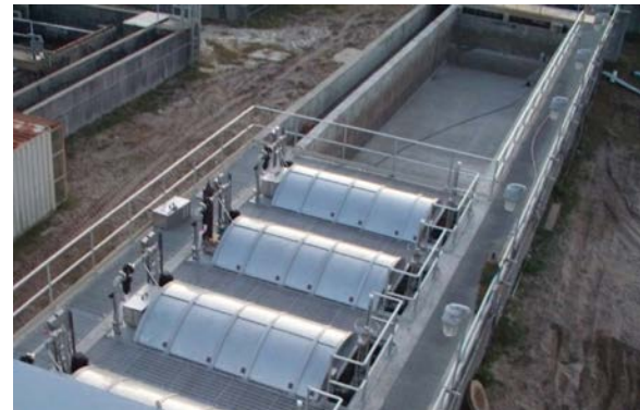
Filtration Capacity to Spare