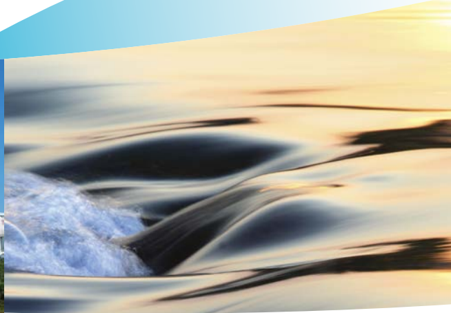
Drop-in Simplicity of Forty-X™ Disc Filters