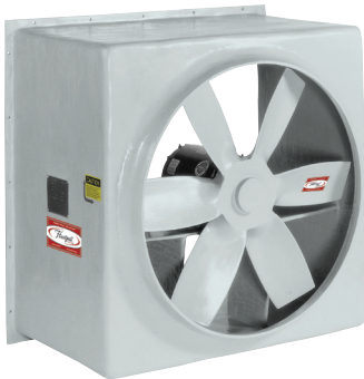
Fiberglass Wall Fan AMCA Certified for Air