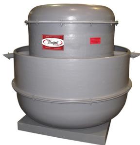
Fiberglass Exhaust Fan