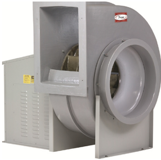
Fiberglass Centrifugal Fan AMCA Certified for Sound & Air